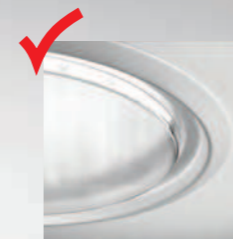
New look Edge Glow