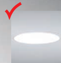
Easier to clean