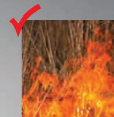
Improved BAL rating