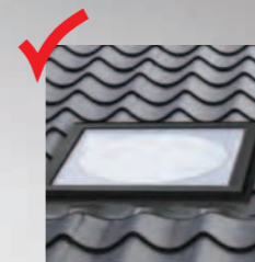
Easier to install